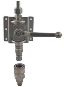
SS outlet valves