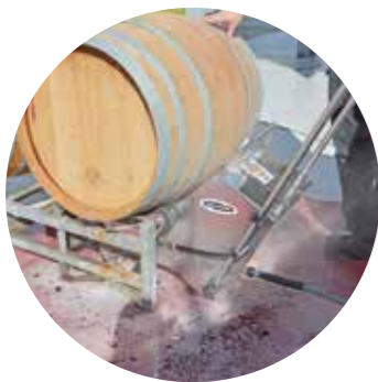
High pressure barrel cleaning equipment ranging from siphoning units to EzyLift or custom built semi-automated systems.