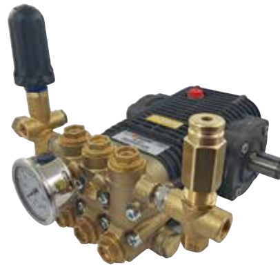
Hot water HP pumps

Save time and money, improve your productivity and get a better return on your investment