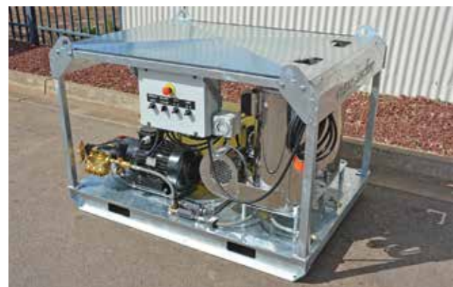
Customised Clean Machine solutions can be stand alone or be interfaced with existing control systems. Designs can be skid mounted, include electronic pressure and flow regulation and hot water generation. Clean Machine can design, specify and project manage design, build and integration. Pictured is a purpose built high pressure, diesel fired hot water pressure unit designed to run two barrel cleaner heads at one time.